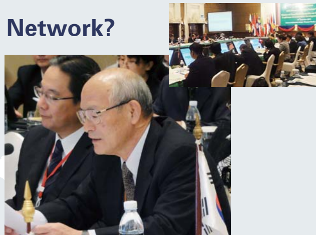
ASEAN+3 EMM in Cambodia (Oct. 2011)

LoCARNet was officially launched at the "East Asia Low Carbon Growth Partnership Dialogue" in April 2012, and has reported its progress to the ASEAN+3 EMM every year.