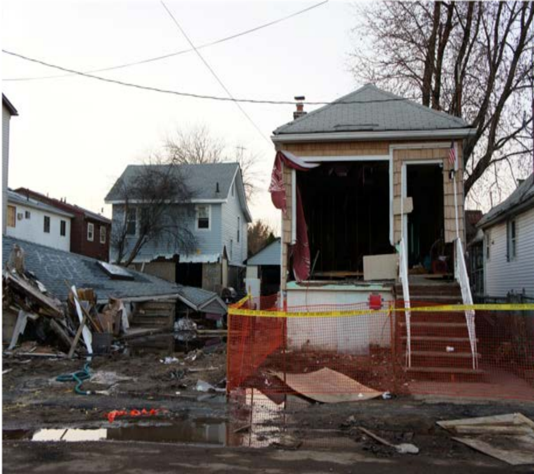
New York City after Superstorm Sandy