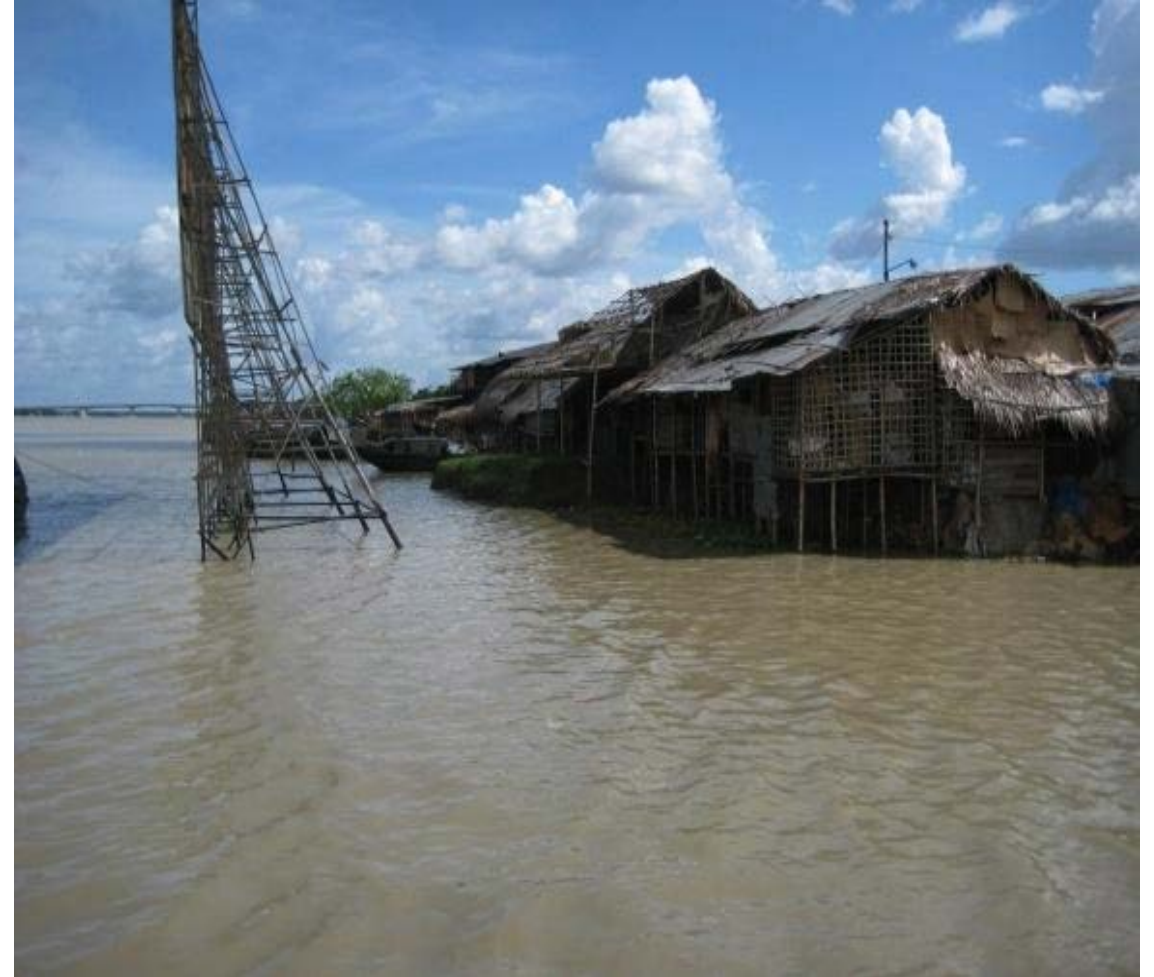
Bangladeshi city after a cyclone hit