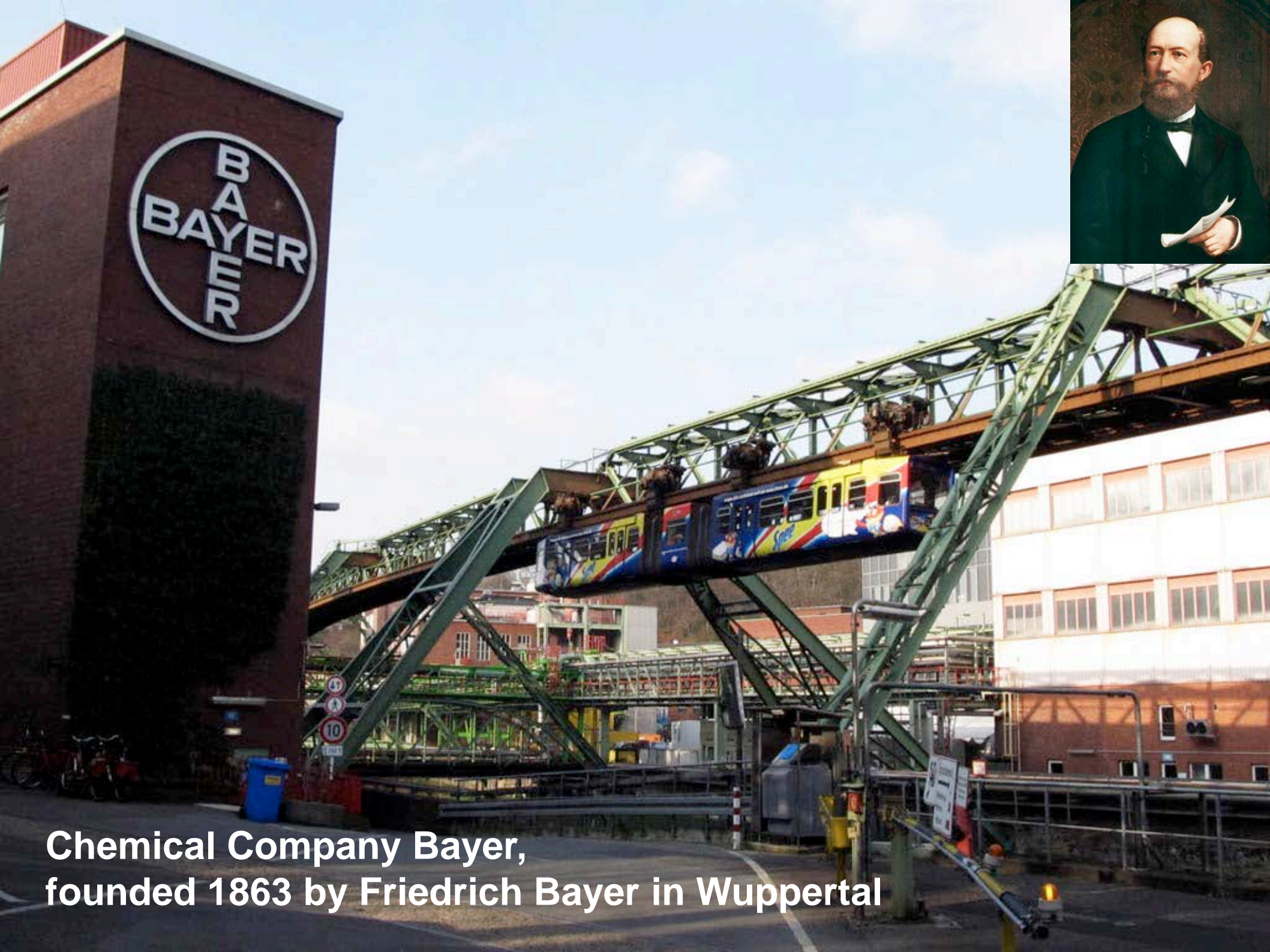
Chemical Company Bayer, founded 1863 by Friedrich Bayer in Wuppertal